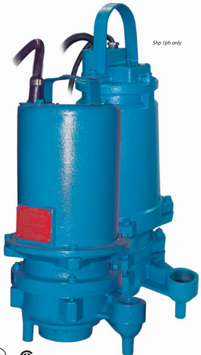
5hp 1ph only

Exclusive non-fouling controls eliminate routine, maintenance service calls.